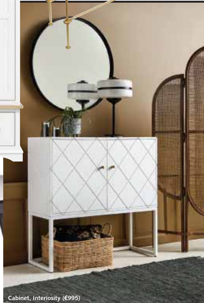
Cabinet, Interiosity (€995)