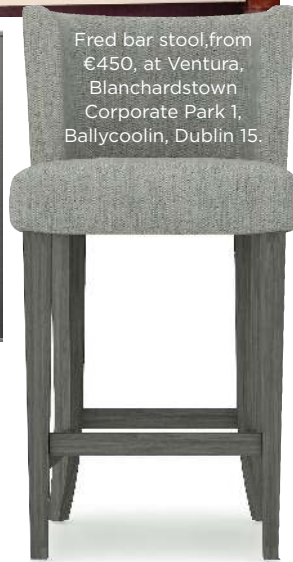
Fred bar stool, from €450, at Ventura, Blanchardstown Corporate Park 1, Ballycoolin, Dublin 15.

You'll never go wrong with top-of-the-range appliances in a stainless steel finish. Check out Gaggenau's smart ovens at Arena Kitchens, www.arenakitchens.com .