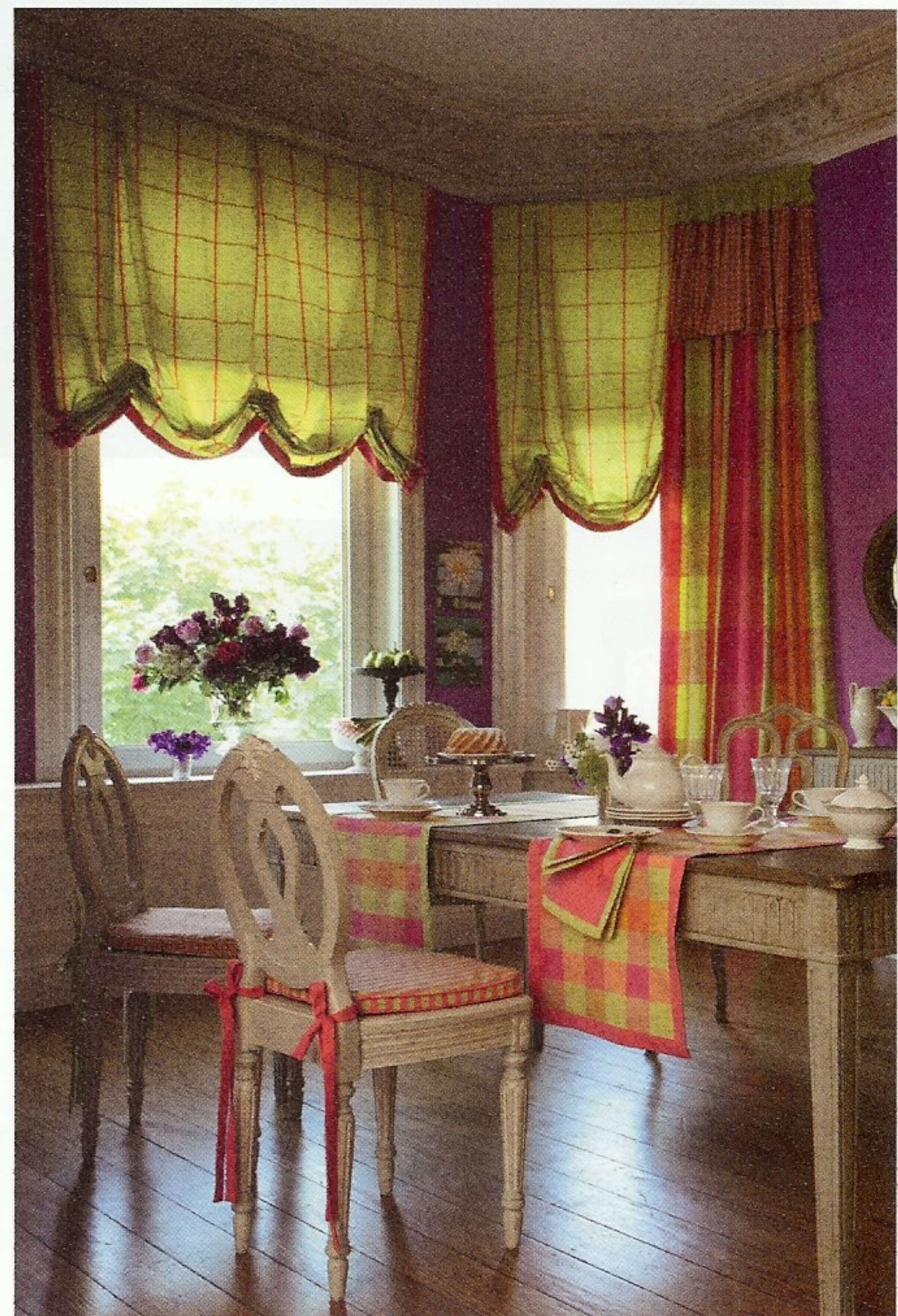
FourSeasons Tablecloths JAB Anstoenz, www.furnishing.ie